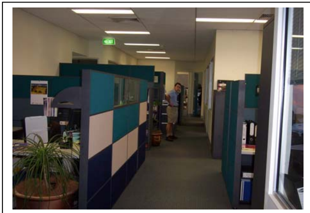
Finance Department located in the Administration Offices in Weld Street.

Modern facilities are enjoyed by our staff members and we boast a positive work culture which balances work and lifestyle. Please see below for comments of some staff members.