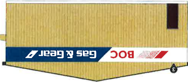
West Elevation (left side)