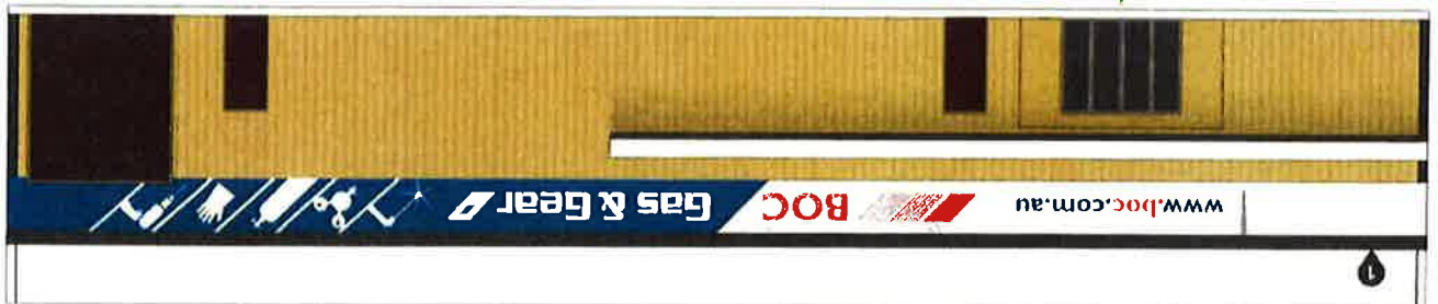
South Elevation (front)