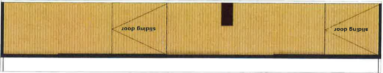
North Elevation (rear)