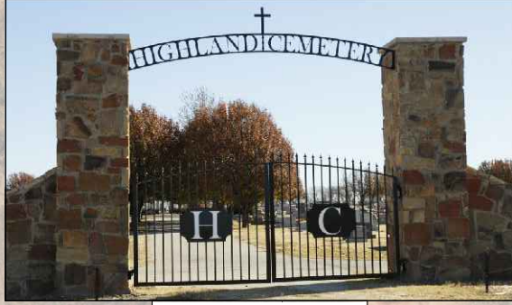
GATED ENTRANCE EXAMPLE