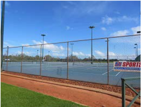
Tennis courts from Eastern corner