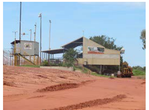
Speedway club house