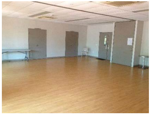
Multi purpose room