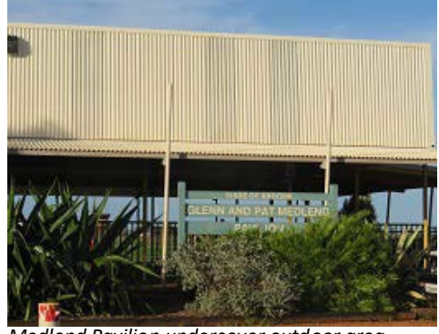
Medlend Pavilion undercover outdoor area