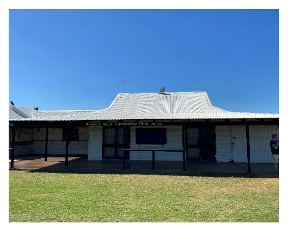
Broome SLSC – Old Club Rooms