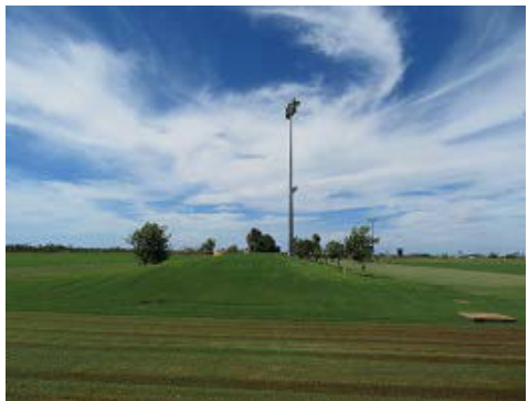
Bank between both fields and 500 lux floodlight