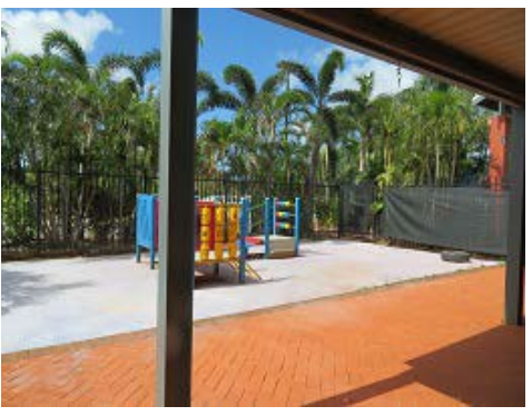
Outdoor enclosed playground