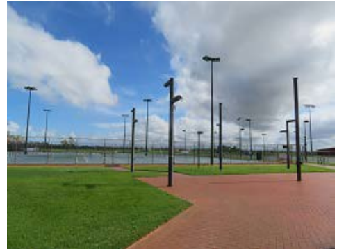
Tennis courts and paved concourse