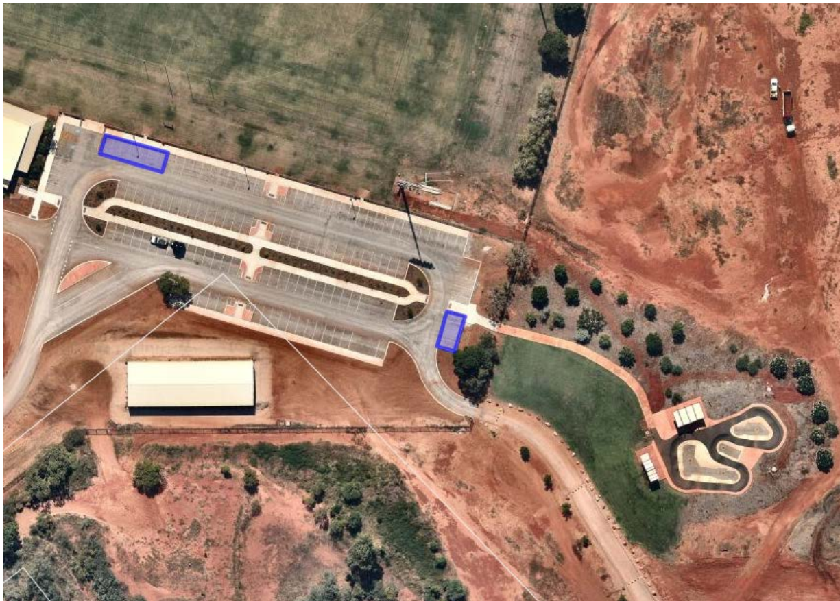
1.3 BRAC Outdoor Basketball Courts