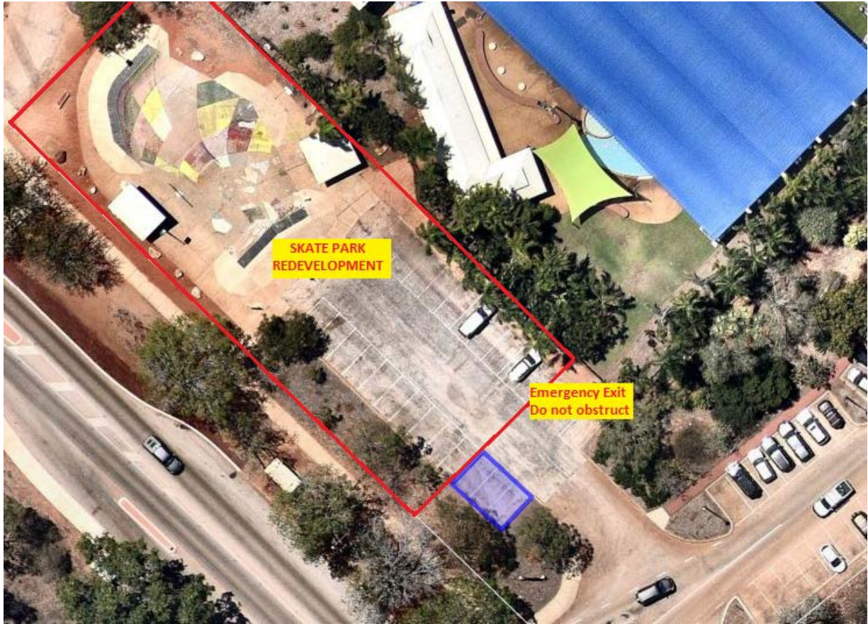
1.2 Glenn & Pat Medlend Pavilion and Pump Track