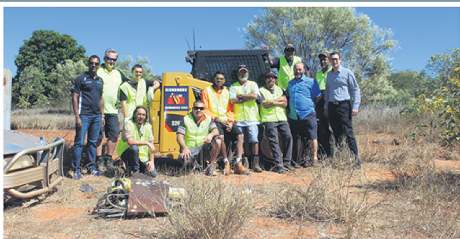
The Shire of Broome is working with organisations such as Training Alliance Group to promote Broome as a training centre and encourage new business.