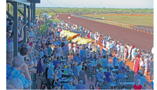
The first race meet for 2016 drew a capacity crowd.

"In recent weeks we've also enjoyed the inaugural Shinju Fringe Festival and the start of the new Thursday Night Markets at Town Beach."