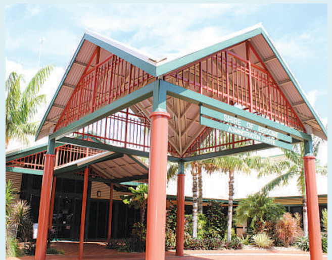
The Broome Shire Council's Annual Meeting of Electors will be held on Thursday 15 December.

Public question forms are available on the Shire website and can be emailed, faxed or delivered to the Shire.