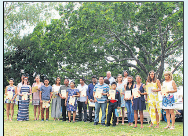
Broome welcomed 18 new citizens on Australia Day.