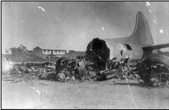
The 75th Anniversary of the WWII air raid on Broome that claimed 88 lives will be marked on 3 March 2017.