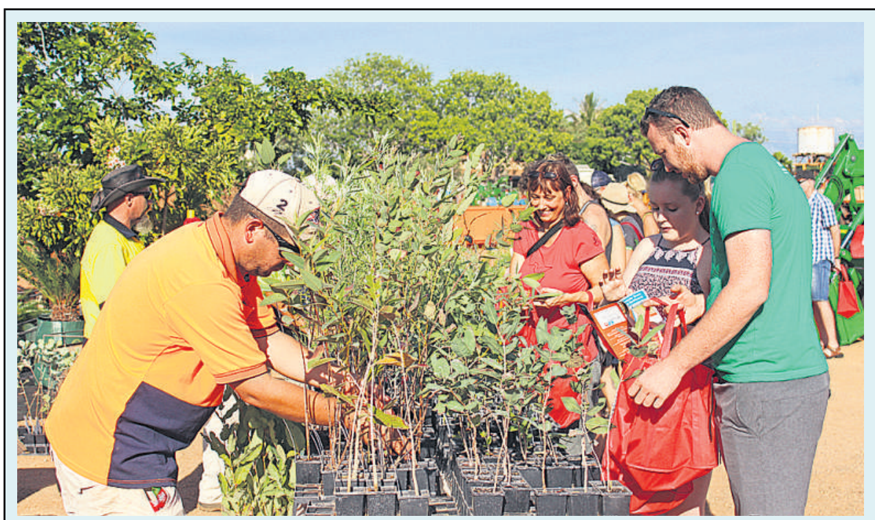
The annual native plant seedling giveaway is happening this Sunday at Cable Beach Amphitheatre.