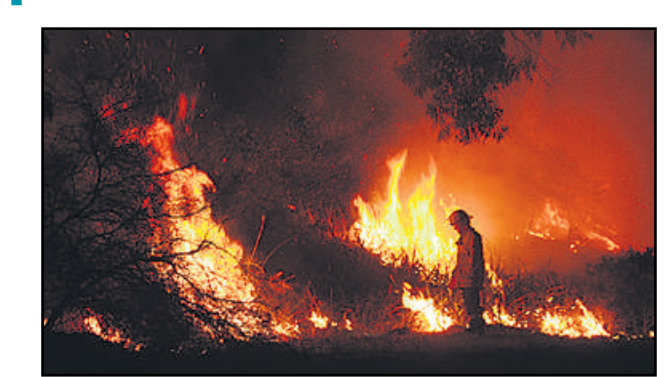
Firebreaks must be in place by 15 May to manage and prevent

The Shire is also working with Fire and Emergency Services, Parks and Wildlife, Yawuru, Broome International Airport, Volunteer Fire and Rescue and Volunteer Bushfire Brigade to carry out controlled burns, install and maintain firebreaks and slash long grass.