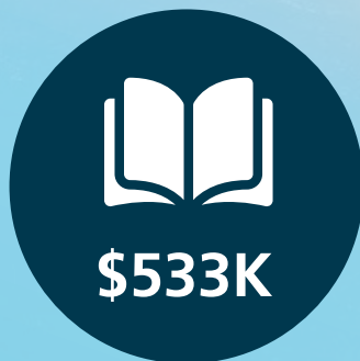
Education & Welfare