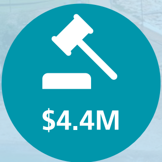
Law, Order & Public Safety