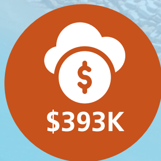
General Purpose Funding