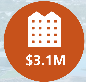
Other Properties & Services