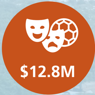
Recreation & Culture