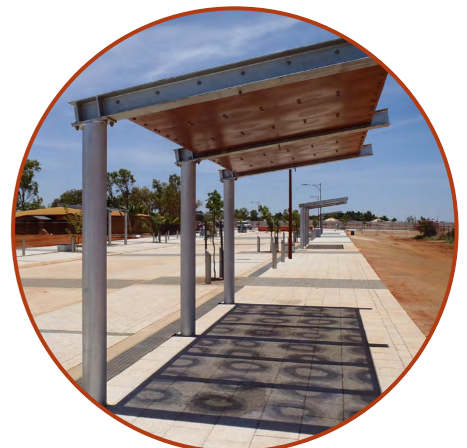
3. Integration into the landscape