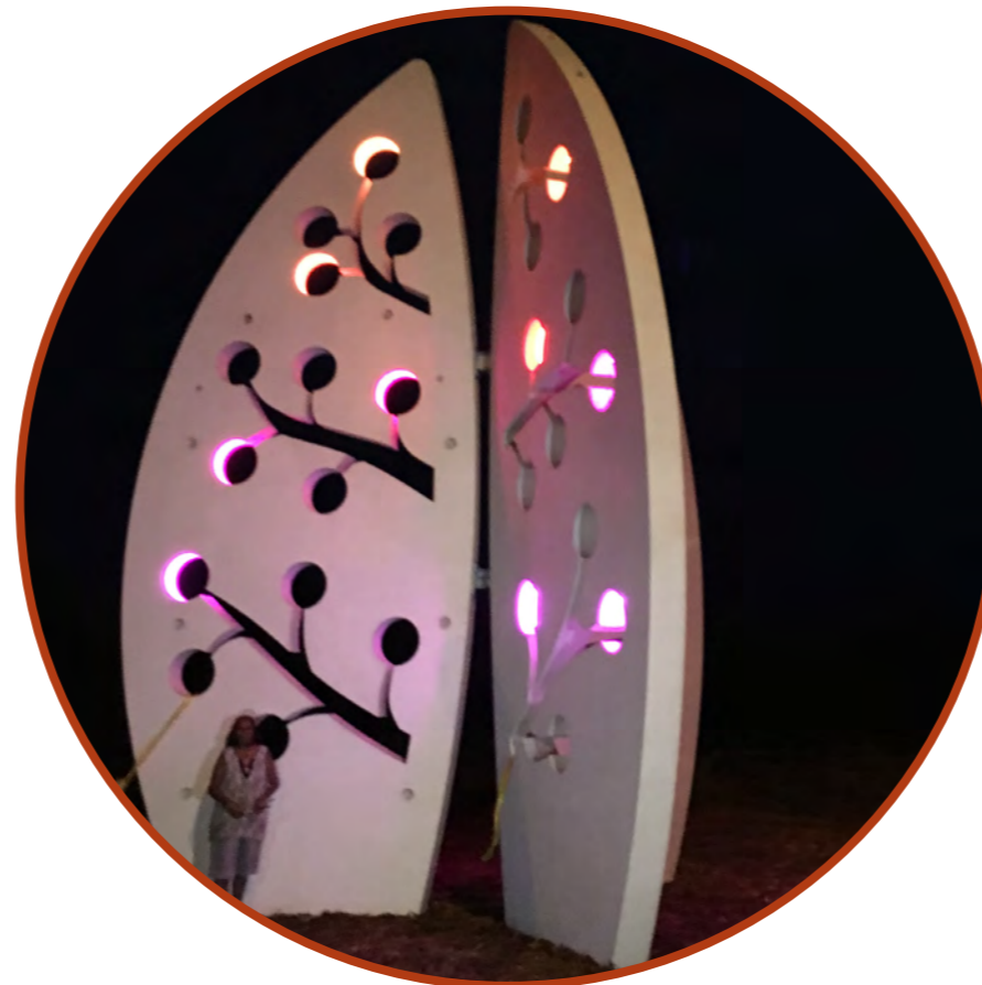
2. Public art