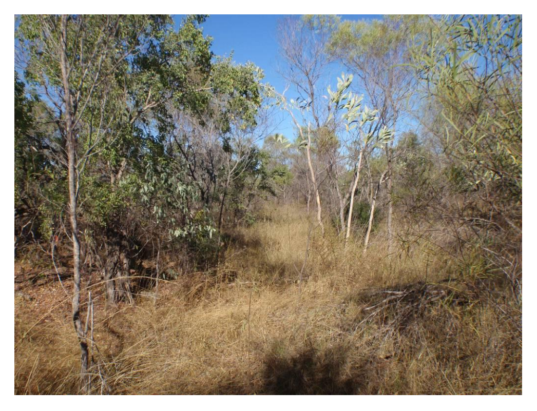
FIGURE FOUR: EXISTING VEGETATION ON THE DEVELOPMENT SITE

Broome North contains a relatively uniform vegetation type; Mixed Acacia low woodland.