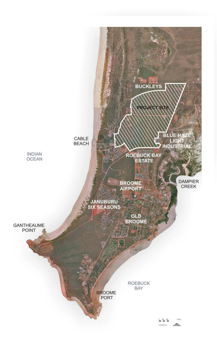
FIGURE ONE: BROOME PENINSULA Broome North Project Area indicated in white

LandCorp plans to subdivide and develop a total of approximately 725ha of land north of Broome Town site and the Broome airstrip. ( Refer to FIGURE ONE )