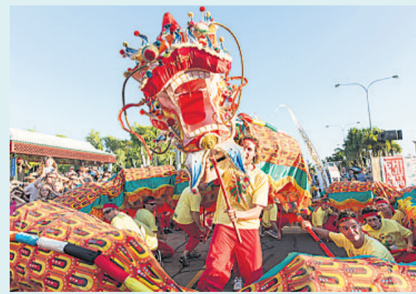
Broome's beloved Shinju Matsuri Festival is back bigger than ever for 2016.

For full details go to www.shinjumatsuri.com.au .