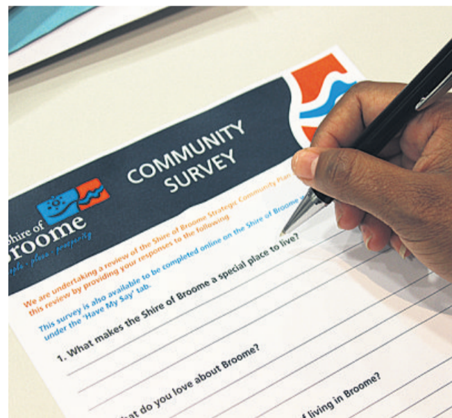
Fill out the survey online or pick up a form from the Shire, Library or BRAC.

The community workshop and information session will be held on Thursday 8 September at 5pm and for more information visit the Shire website.