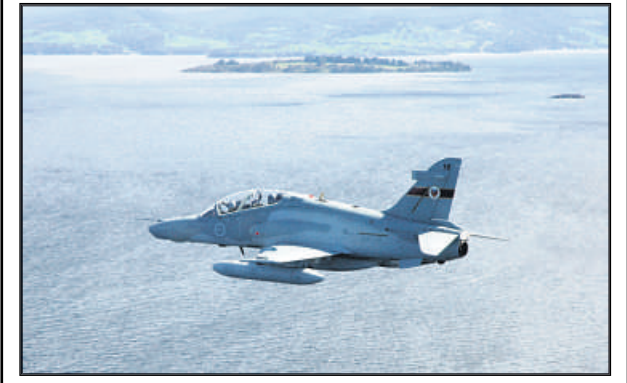
RAAF No. 79 Squadron will provide a flypast to conclude the 75th Anniversary Memorial Service.