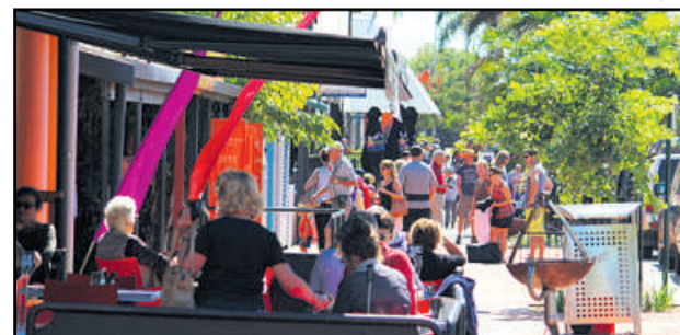
Parking time limits are enforced so that visitors and locals can use Chinatown's cafes, restaurants, galleries and shops.

"It's in the best interests of the traders in Chinatown that their customers can park, and that bays are not taken up by staff and