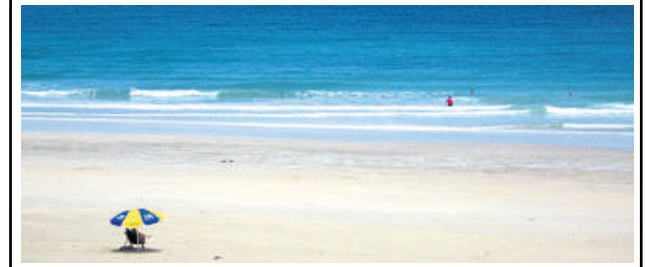
Cable Beach's status as one of the world's best would be enhanced under a draft Masterplan.

To view the Cable Beach Foreshore Masterplan and provide feedback visit the Shire of Broome website.