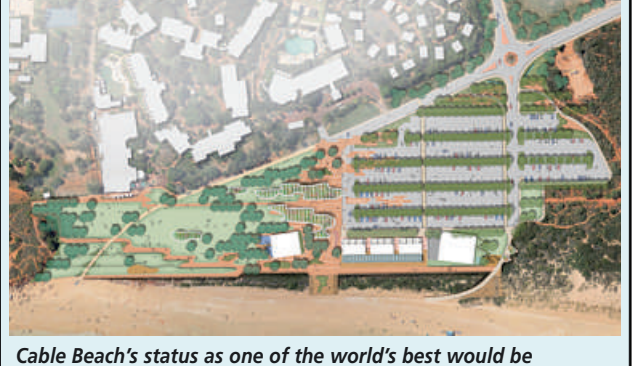
Cable Beach's status as one of the world's best would be enhanced under a draft Masterplan.

To view the Cable Beach Foreshore Master Plan and provide feedback visit the Shire of Broome website