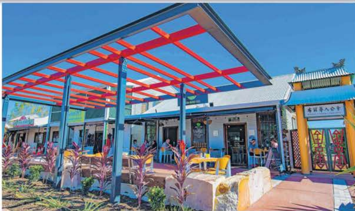
Community members are encouraged to join the new Chinatown Team.

BRAC. It's time to get into training with the BRAC 2 Beach Fun Run happening again. Broome's biggest annual fun run is back for its ninth year and will offer a choice of 8km or 4km courses to suit all fitness levels. Entries open soon.