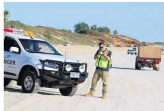
Shire Rangers are enforcing the 15kmh speed limit on Cable Beach.

Rangers will also monitor parking on Cable Beach including ensuring that vehicles move north of the rocks after driving onto the beach.