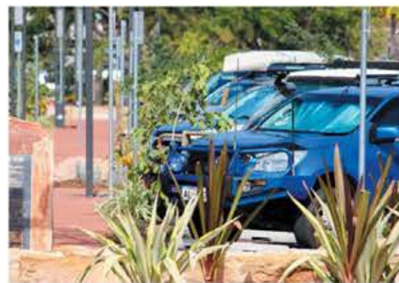
Work to add 46 car bays and improve stormwater drainage in Chinatown is underway.

Other ongoing work in Chinatown includes a new bus stop on Carnarvon St at the edge of Male Oval, installation of filigree art panels created by Broome's Chinese community and Yawuru into street lights in Carnarvon St and Dampier Tce, and infrastructure for free WiFi.