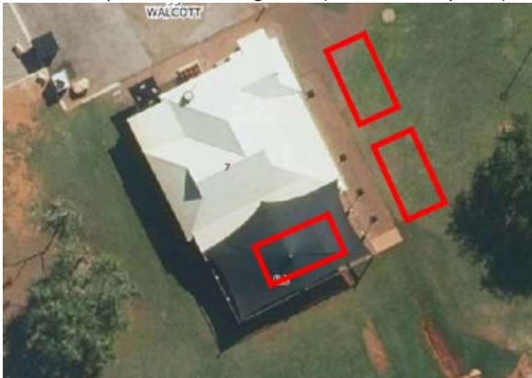
MAP 1 – Proposed new Trading Zones (with access to power)

Three new temporary Trading Zones have been proposed below and will be finalised in discussion with Traders. No generators are permitted. Power will be provided to successful Traders at no cost if they can locate near the existing café. The shade frame and sail will be removed if this location is selected.